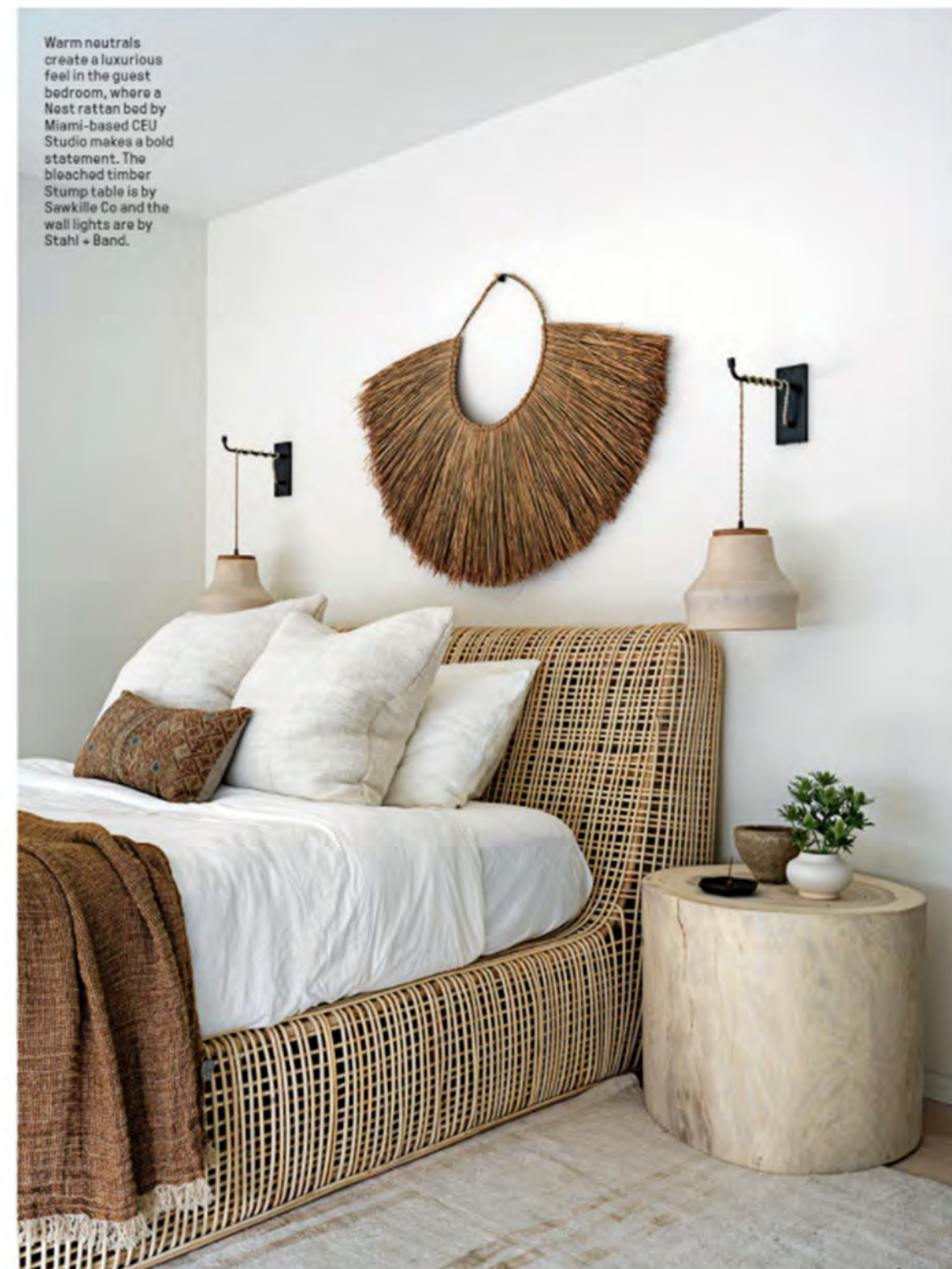
Warm neutrals create a luxurious feel in the guest bedroom, where a Nest rattan bed by Miami-based CEU Studio makes a bold statement. The bleached timber Stump table is by Sawkille Co and the wall lights are by Stahl + Band.