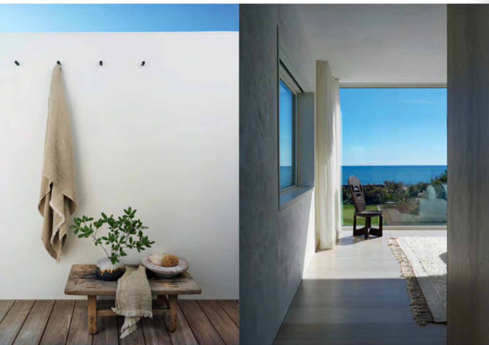
ABOVE FROM LEFT: The outdoor shower area on the pool deck; in the master bedroom, a vintage wooden chair is paired with a cream rug from LA rug specialist Mehraban.

a story that unfolds seamlessly, from the moment you get home to the moment you go to bed at night."