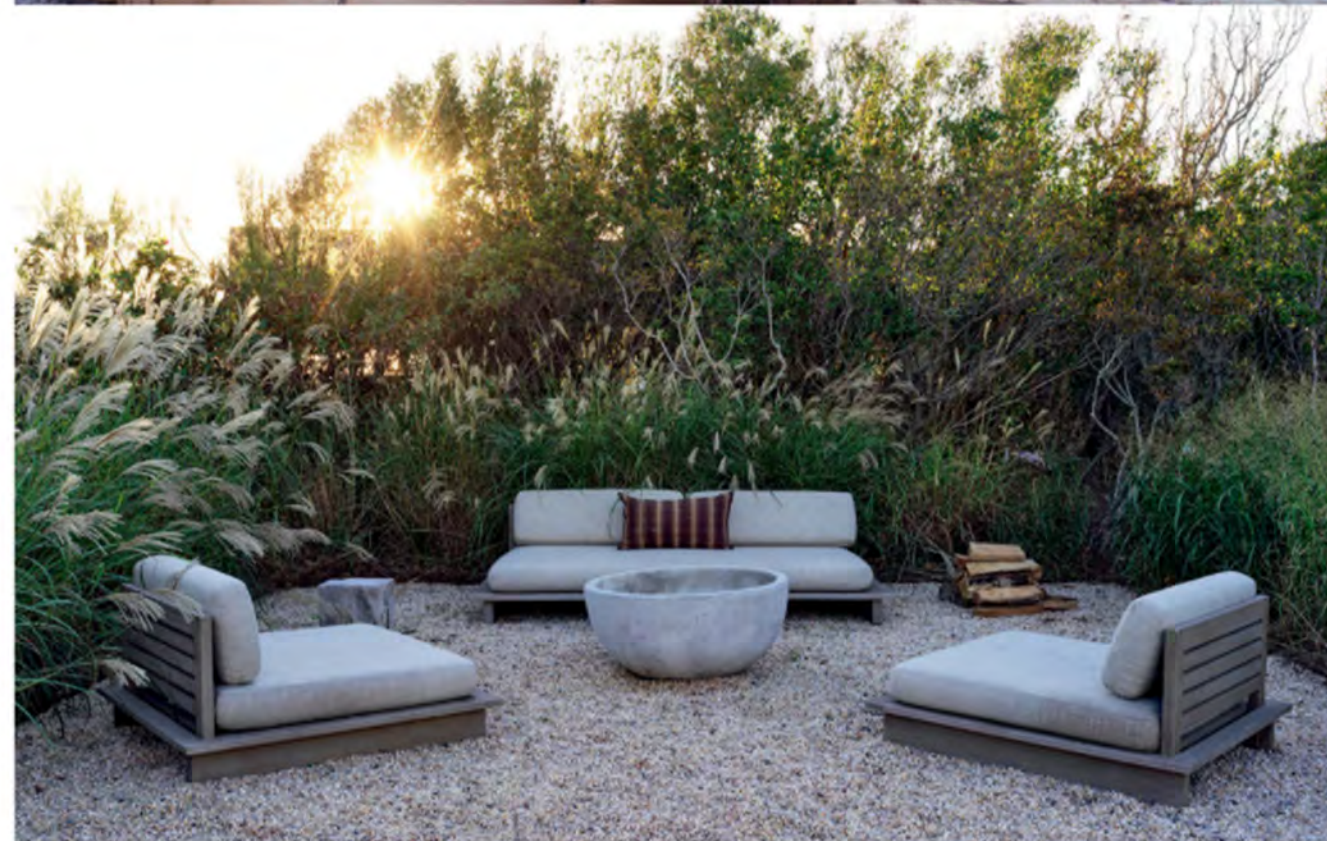
ABOVE FROM TOP: A palette of bleached neutrals runs through the entire house, including the living room, which is dominated by a vintage Cameleonda sofa by Mario Bellini for BSB Italia, from Morentz in the Netherlands. The coffee table is a custom piece by Belgian designer Axel Vervoordt and the textured rug is by Woven in New York; this outdoor nook with concrete firepit, overlooking the sea, is where the family spends much of its time in summer. The seating is from RH Modern's Maldives collection.